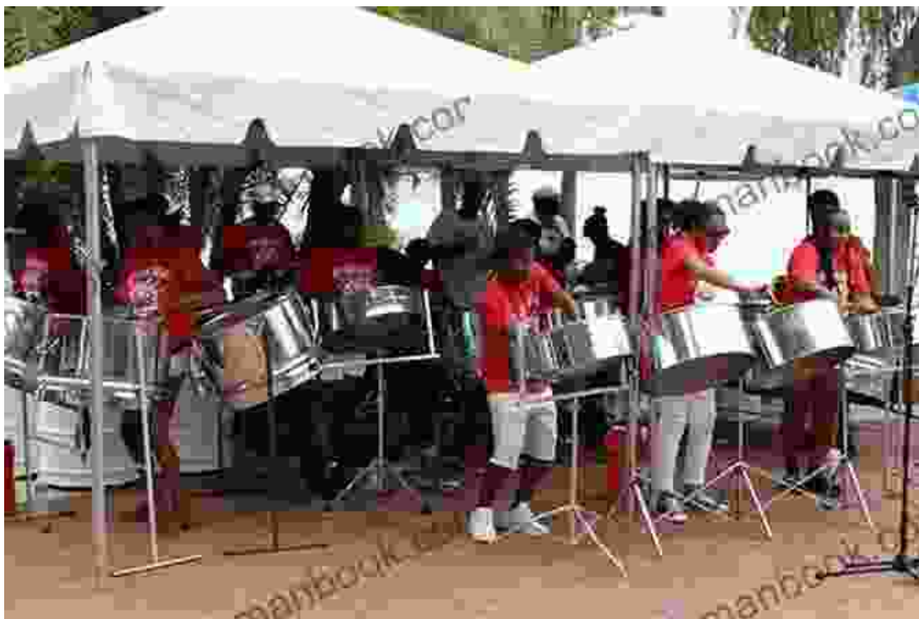
Steel drums as a symbol of celebration and cultural pride